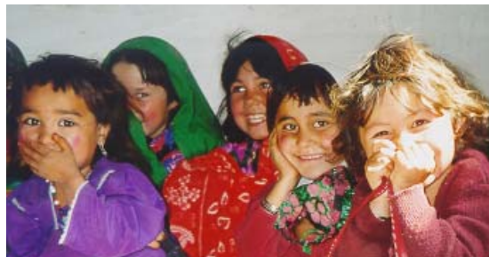
Afghanistan, Christian Children's Fund

Promoting the active participation of girls as agents of change in their own lives, families, communities and societies.